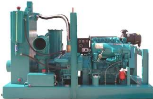
Can be painted any color

Holland Pump Company Corporate Office: 7312 Westport Place West Palm Beach, FL 33413 USA 1-800-451-0769 www.hollandpump.com