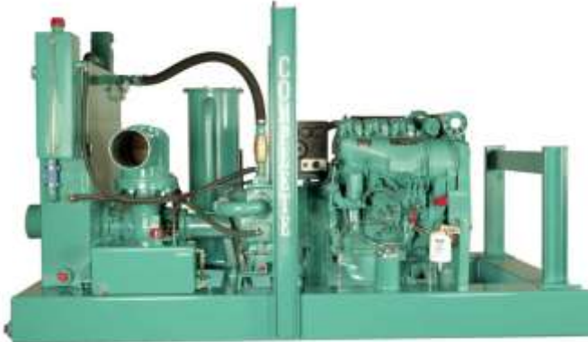
Can be painted any color

Holland Pump Company Corporate Office: 7312 Westport Place West Palm Beach, FL 33413 USA 1-800-451-0769 www.hollandpump.com