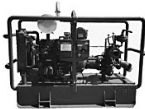
Performance Curve Model: J6 - D6068HF285 Size: 6" Jet Pump

Approximate Dimensions Powered by Deere 6068HF285 Diesel Engine Skid Weight: 6,000 lbs.